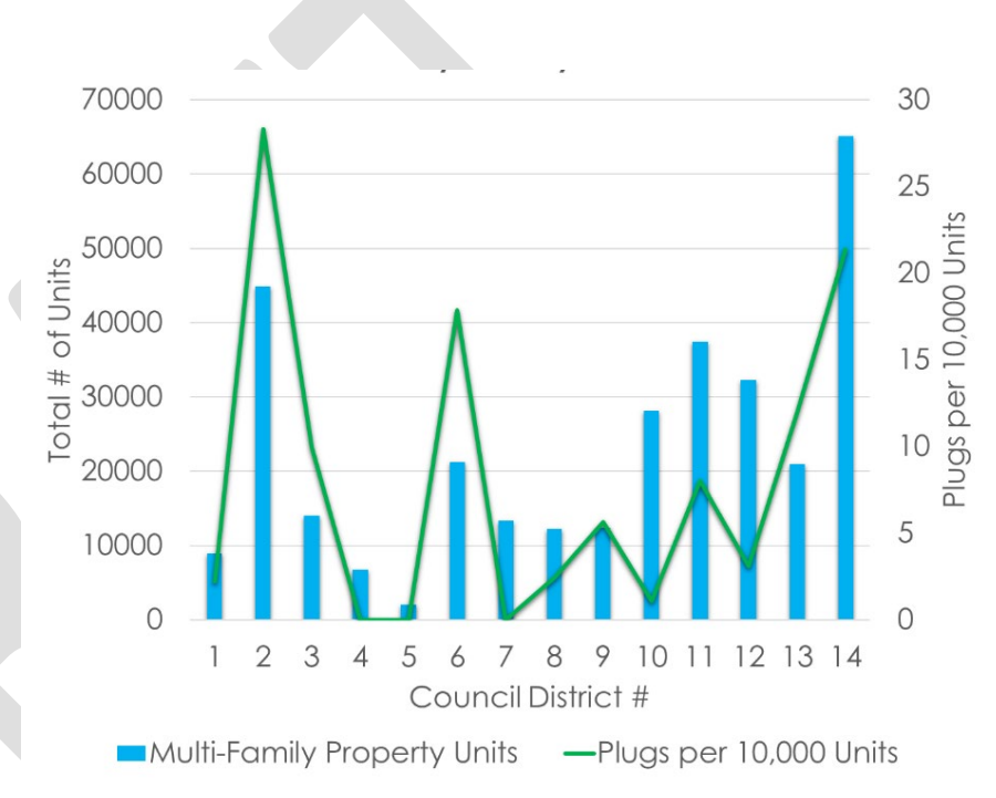
Exhibit B: Availability of Publicly Accessible Charging Plugs and Multi-Family Units by Council District

While having locational proximity to a charger is important, true accessibility is in part determined by the ratio of people needing charging access to available plugs. To determine this density-based accessibility, DFWCC calculated the ratio of the number of publicly available EV charging plugs accessible compared to the amount of total multi-family units. There are nearly 320,000 multi-family units and 398 EV charging plugs across the City of Dallas. Citywide, there is an average of 12.4 accessible EV charger plugs per 10,000 multi-family units. However, as shown in Exhibit B, when broken down by city council districts, the amount of accessible EV charger plugs varies greatly. Working to create a higher and more consistent ratio of plugs to housing units across all parts of the city may be helpful in improving charging accessibility, and this analysis helps focus on where those efforts may need to take priority.